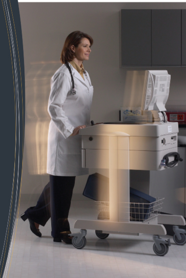
InterCare Vascular Diagnostic Center Vasogram CARE Program

Please call 866-767-IVDC for an immediate appointment